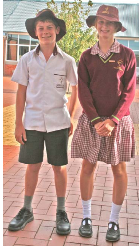
Correct Junior School Uniform – Years 7 – 10