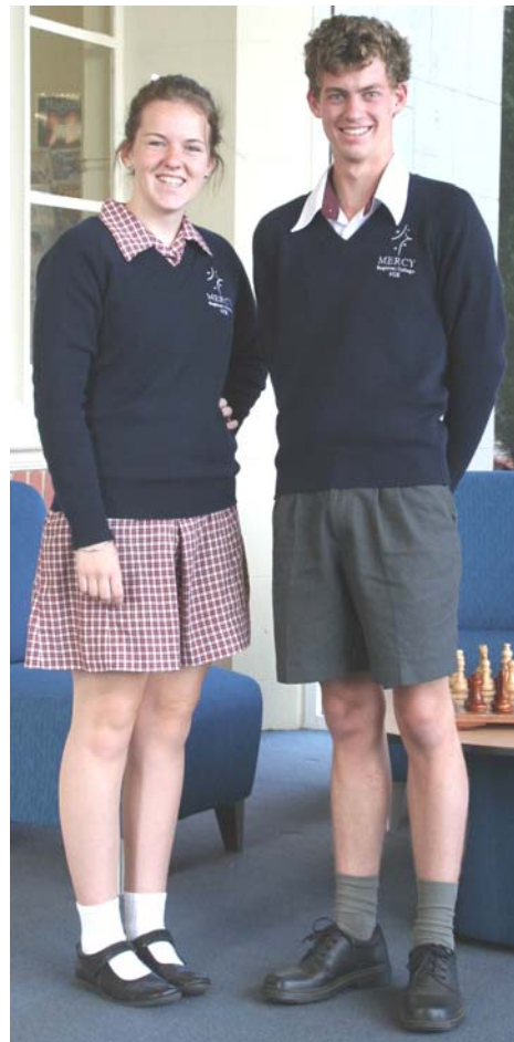
Correct Senior School Uniform – Years 11 & 12