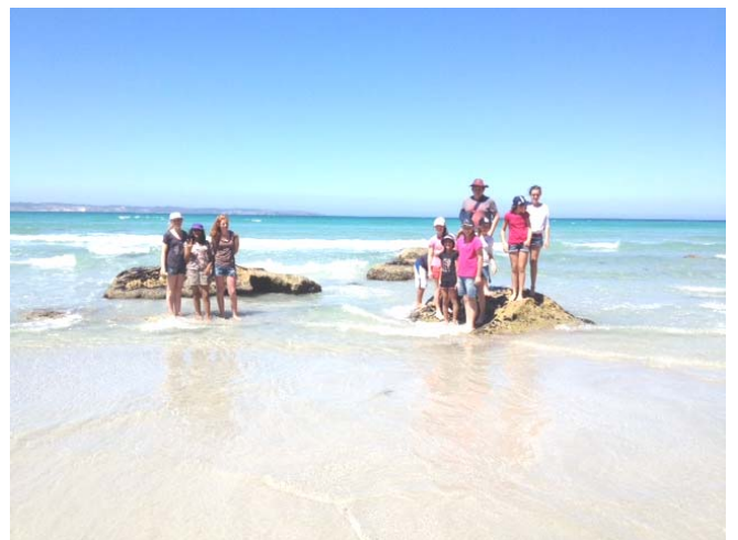
Photos above are from Year 12, 2011 Graduation