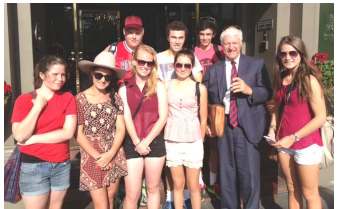
Some of our students walking around the central business district of Melbourne ran into Bob Katter MP.