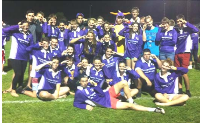
Relay for Life

Generally speaking the students are trying hard and enjoying all that is Mercy. There are two things that we need to tighten up on, and we would like to make parents aware of this.