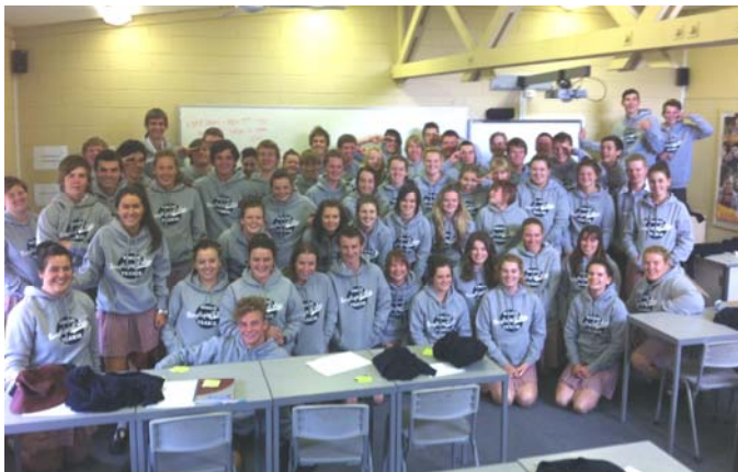
After school classes

Other significant events can be seen in the photos below.