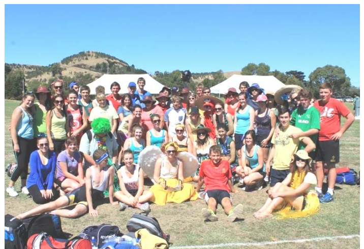
Year 12 group