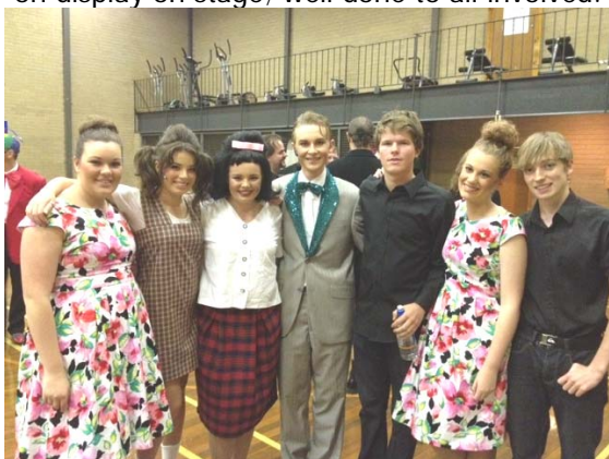
Year 12 Cast Members