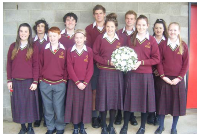
Students @ Mortlake