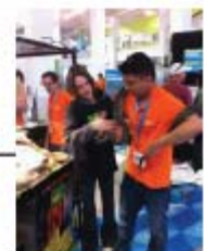
All photos taken at University of Tasmania and Uni of Canberra Open Days