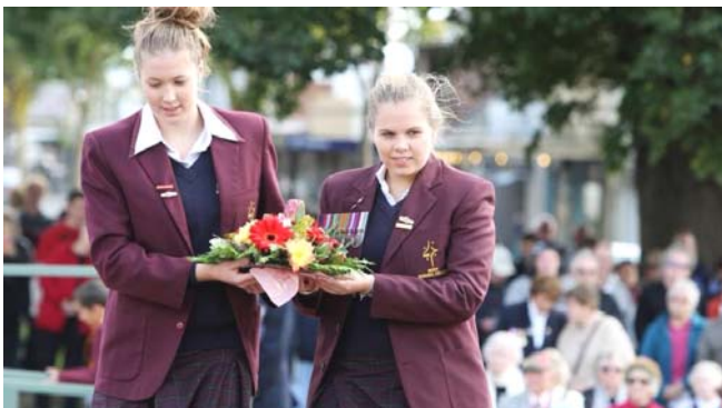
Students @ Camperdown