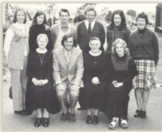
Pioneer Staff of CRC

As a past or present family of CRC / MRC we invite you to attend the celebrations planned to commemorate 40 years of Catholic Education at our school.