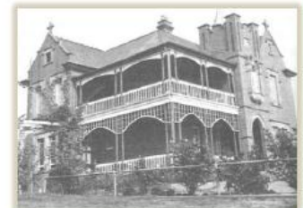
Old Convent Building