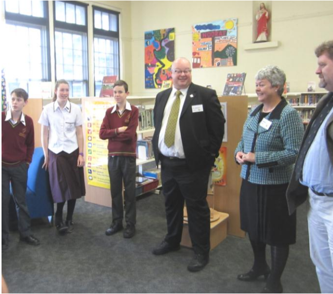
BDSAC members visiting with some pupils in the O'Keeffe Campus Library.

BDSAC members enjoyed tours around both campuses, lunch with McAuley Campus staff today and dinner with the HCSN school boards last night.