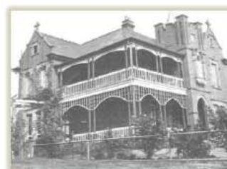
Old Convent Building