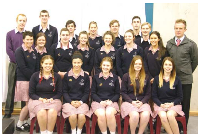
2013 Student Leaders