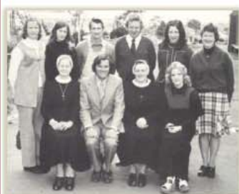
Pioneer Staff of CRC

As a past or present family of CRC / MRC we invite you to attend the celebrations planned to commemorate 40 years of Catholic Education at our school.