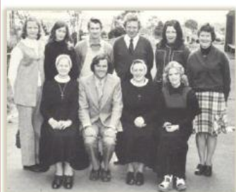
Pioneer Staff of CRC

As a past or present family of CRC / MRC we invite you to attend the celebrations planned to commemorate 40 years of Catholic Education at our school.