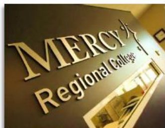
Reception Office Camperdown

Five Star Function Centre, Camperdown with special guest speakers and entertainment by "Sidekick Therapy"