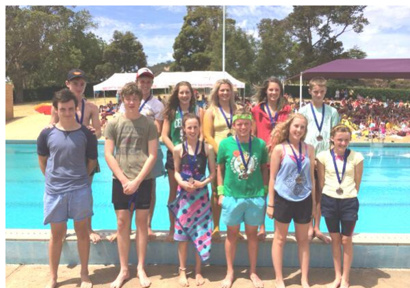
Age Group Champions