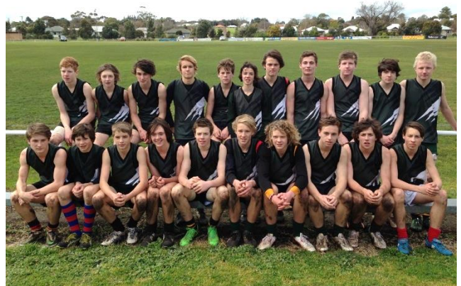
The Hampden combine team