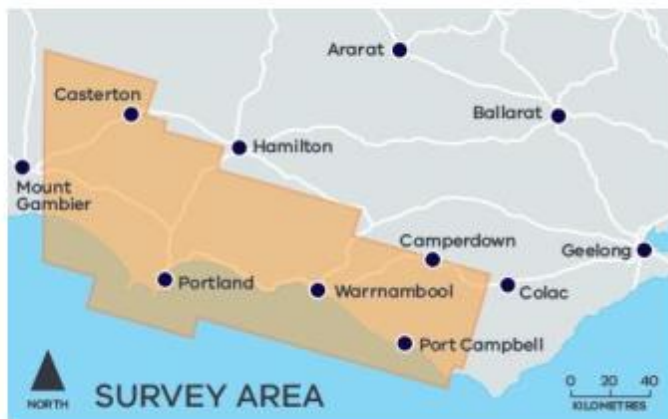
Map of the survey area

Further information can be found at earthresources.vic.gov.au/gasprogram or by calling 136 186 or email to VGP@ecodev.vic.gov.au