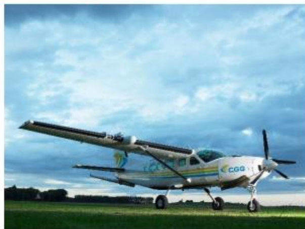
One of CGG's planes to be used for the survey