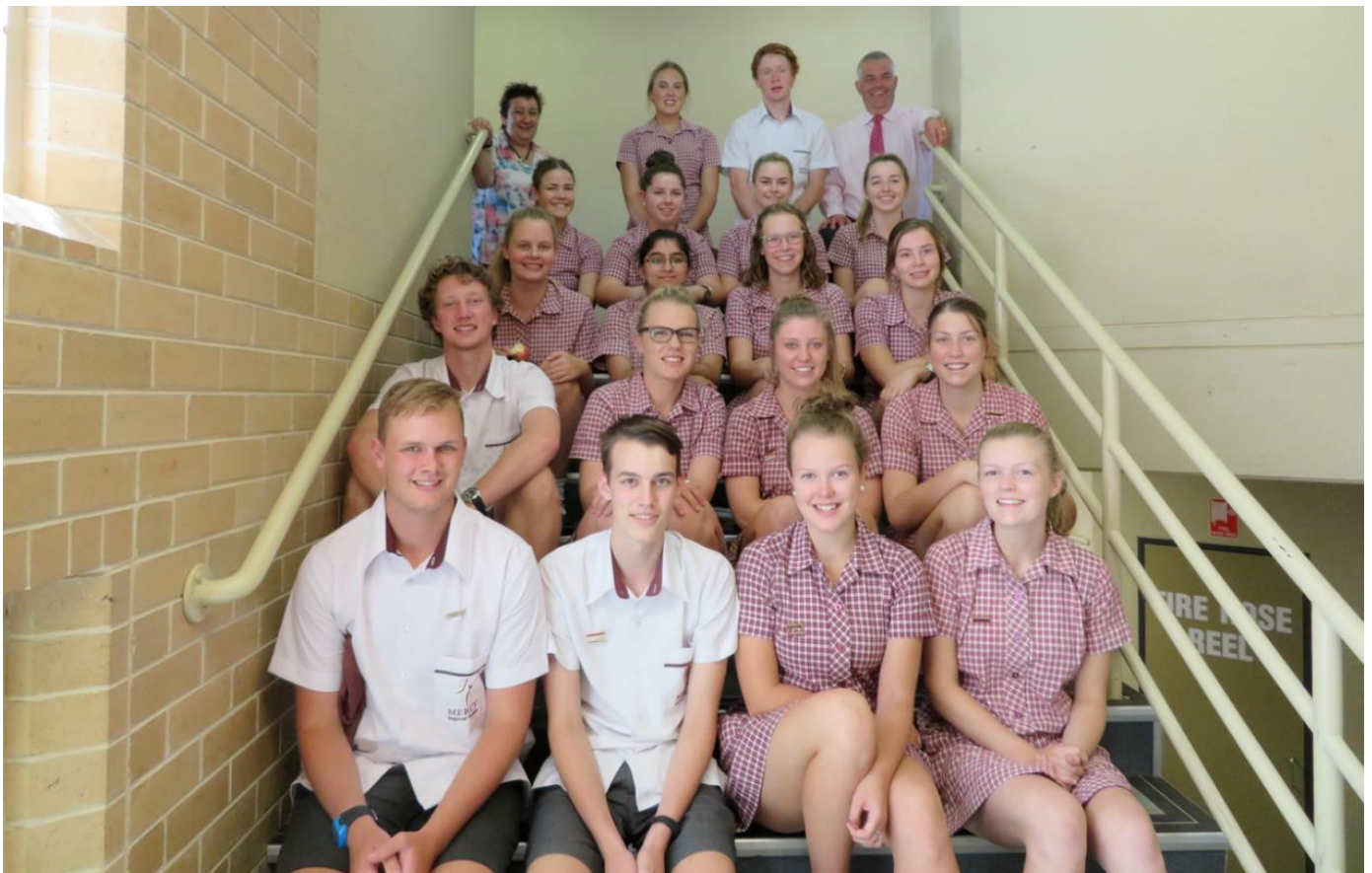
Year 12 Leadership Group