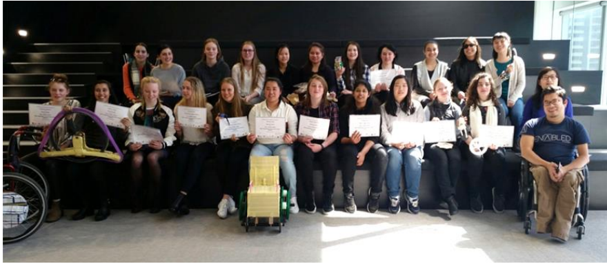
FSA Team 2016

FULL STEaM AHEAD - Girls Designing an Inclusive Society. A one-week STEM based work experience program for Year 10 Girls – 10-14 July 2017