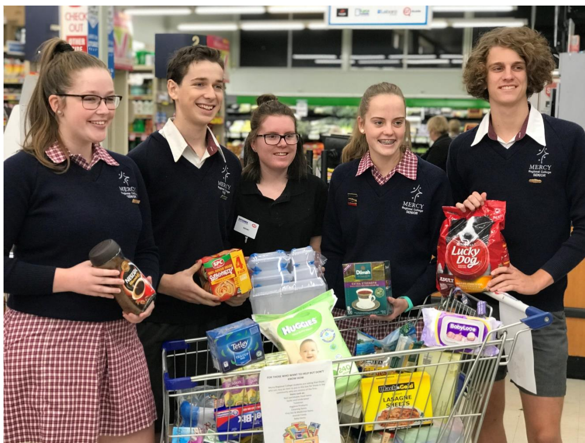
Mercy Regional College students collecting donations of food to be given to families affected by the fires.