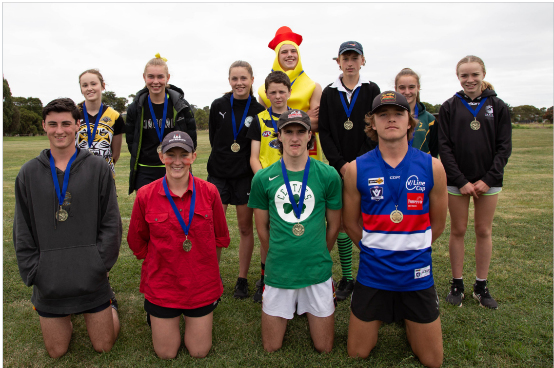
Athletics Age Champions 2020