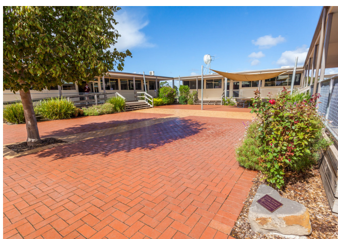
The O'Keeffe Campus Courtyard

At Mercy Regional College we recognise the significance of facilitating a smooth and inclusive transition for all students to their secondary school experience. To support this transition, all Year 7 students attend our dedicated Junior School campus located at Noorat. The O'Keeffe campus is shared with Year 8 students and the curriculum is designed to meet the individual learning needs of all students whilst providing an opportunity for connection to the environment, local community and to our shared history inclusive of the traditional owners of the land on which we learn.