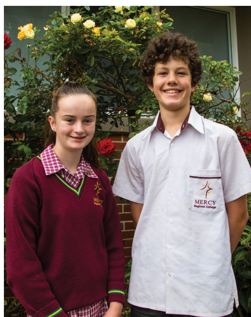
The O'Keeffe Campus Captains 2020