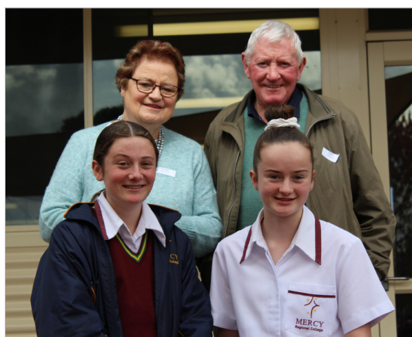
Grandparents & Special Friends Day 2019