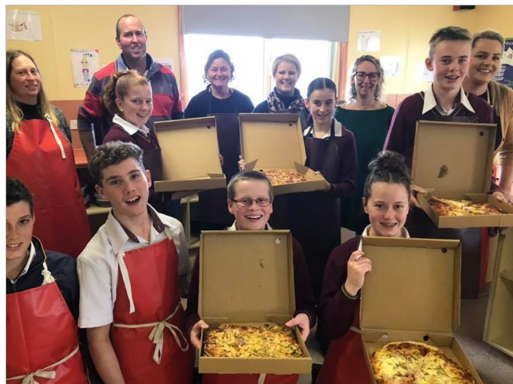
Mercy Kitchen 2019

Further information will also be sent home early in Term 1.