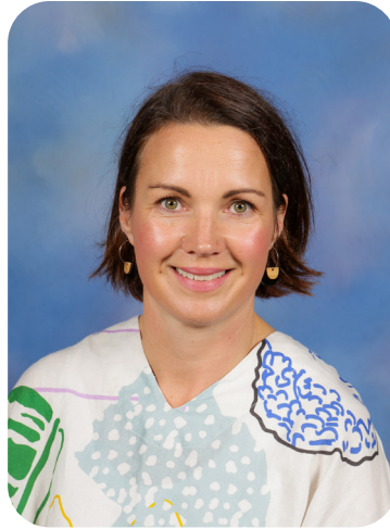
Year 7 - 10 Learning Leader