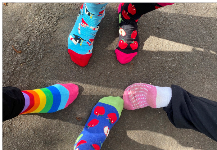
Crazy Sock Day 2020