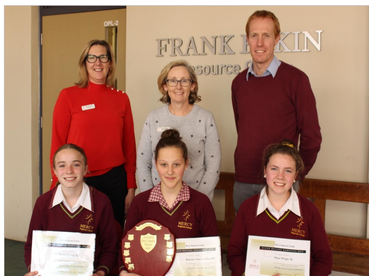
Junior Oratory Competition 2019