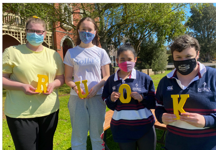
R U OK? Day 2020