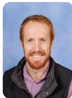
Assistant Senior Years Leader