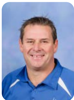
Senior Years Leader