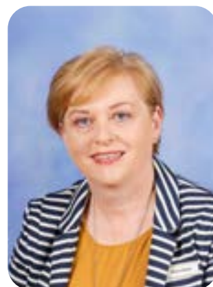
Senior School Administrator