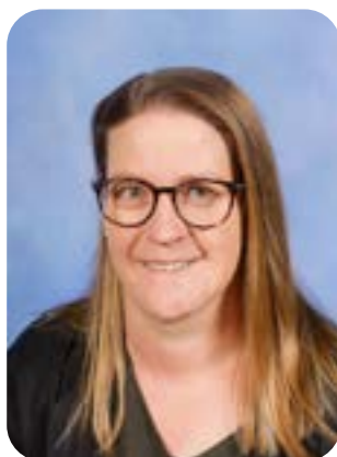
Senior Pathways Leader