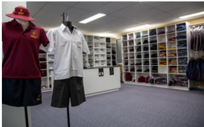
Uniform Shop located at McAuley Campus

If you have any questions regarding uniform, please contact the uniform shop on 7020 2625 or email uniform@mercy.vic.edu.au .