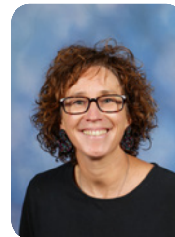
Learning Diversity Leader