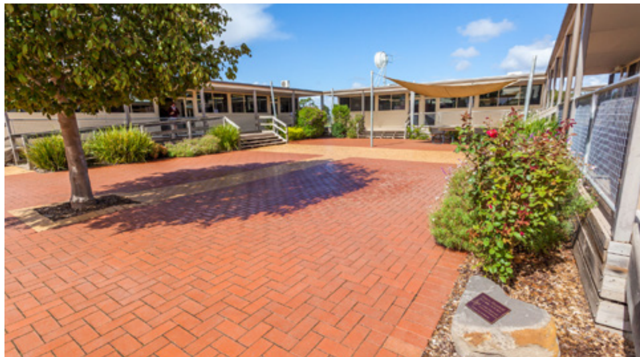
The O'Keeffe Campus Courtyard

At Mercy Regional College we recognise the significance of facilitating a smooth and inclusive transition for all students to their secondary school experience. To support this transition, all Year 7 students attend our dedicated Junior School campus located at Noorat. The O'Keeffe Campus is shared with Year 8 students and the curriculum is designed to meet the individual learning needs of all students whilst providing an opportunity for connection to the environment, local community and to our shared history inclusive of the traditional owners of the land on which we learn.