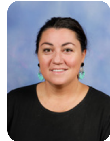
Learning Leader - O'Keeffe